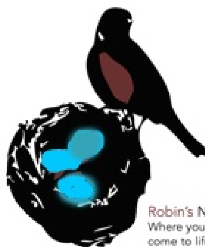
Robin's Nest Where your creative ideas come to life